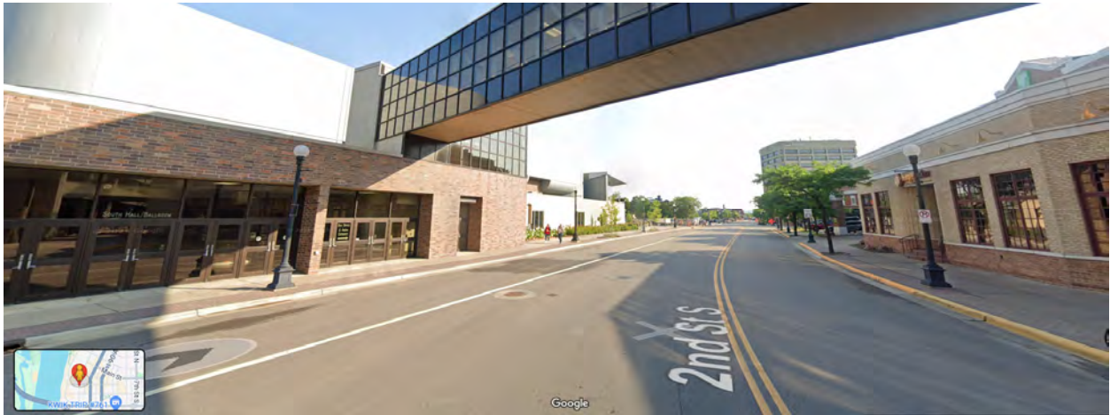
STREET VIEW OF LA CROSSE CONVENTION CENTER

This is the 2 nd Street South entrance to the Convention Center.